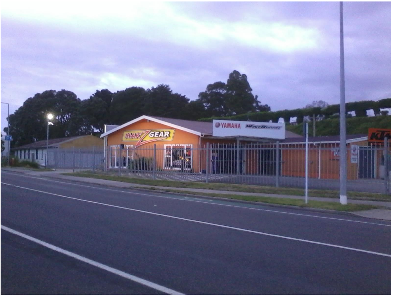
The Garrison Club & Officers Club as at 8 th December 2015. Not due for demotion!