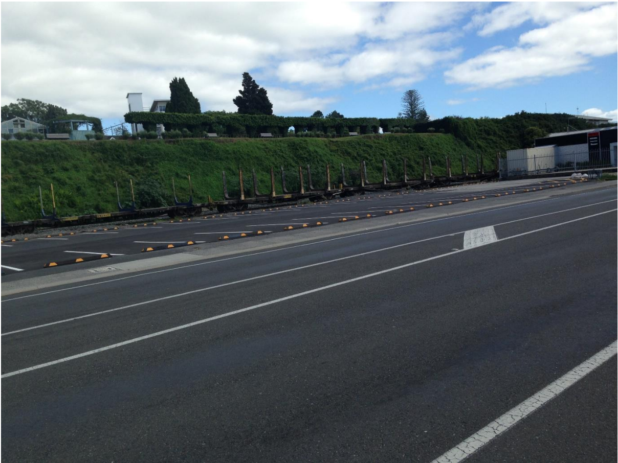
Now a carpark, taken from the road. Towards the port