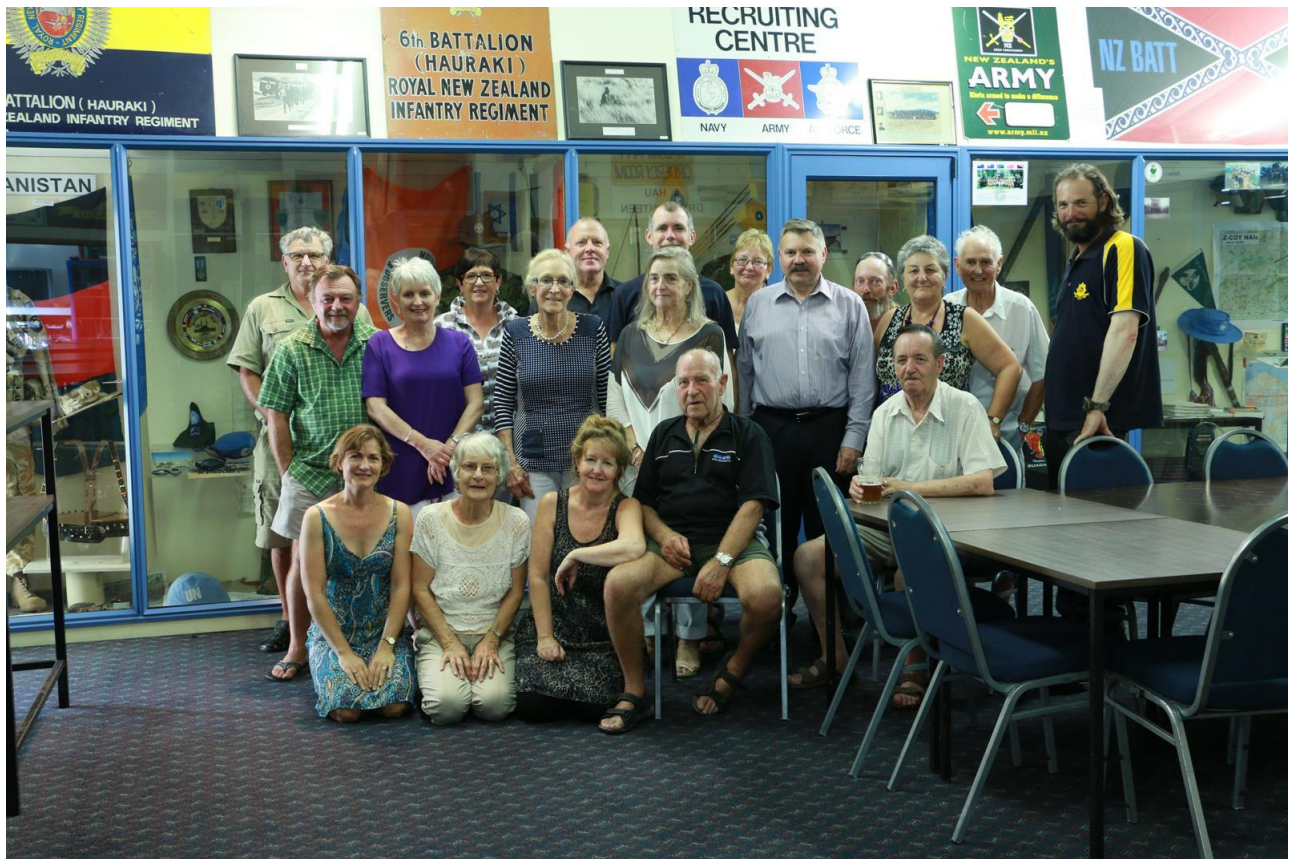
Committee members in the Museum February 2016