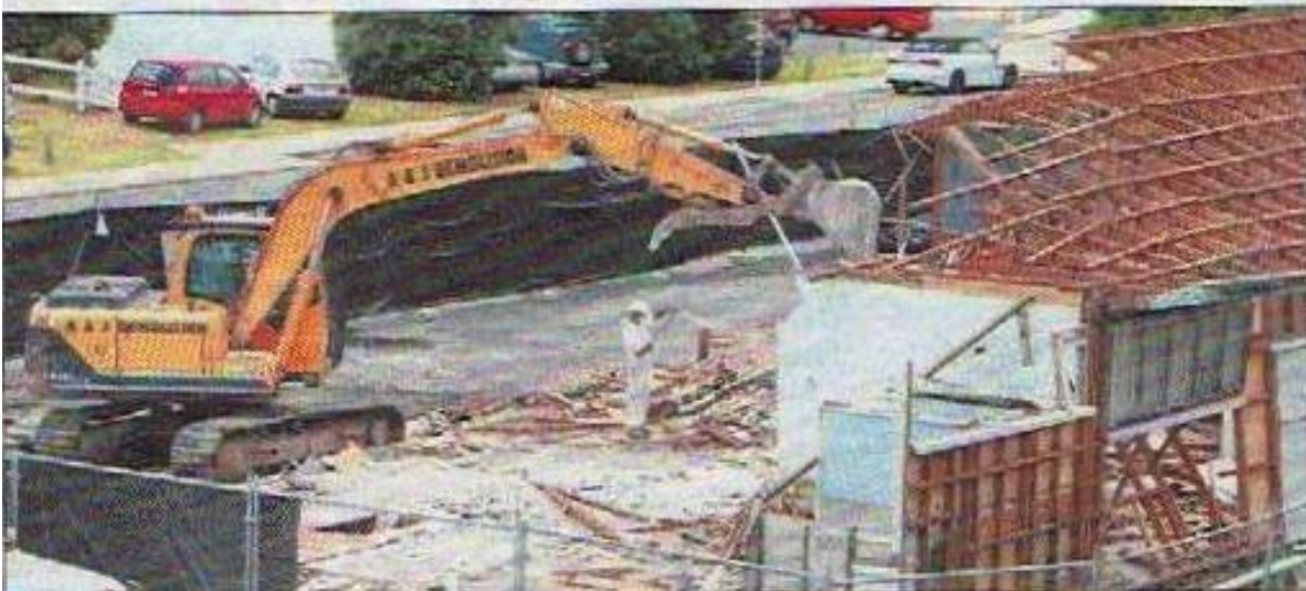
21 st December 2015