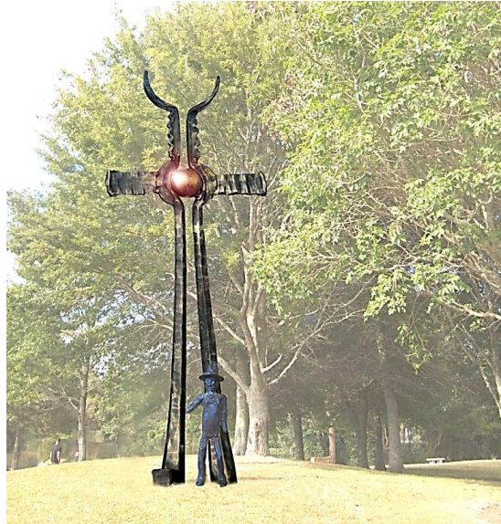
James Say Trust