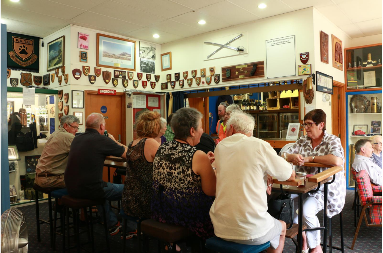
In the Bar