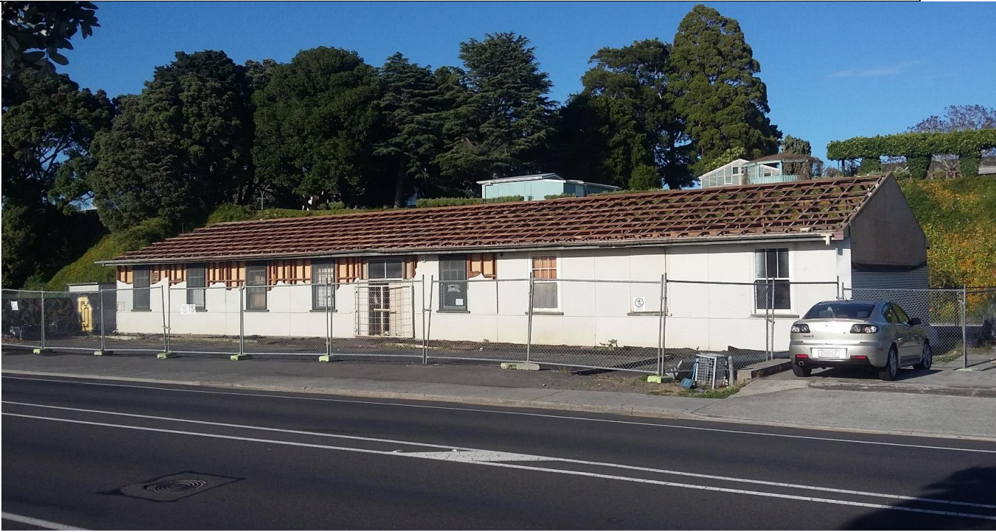
The Army Hall being prepared for demolition – 8 th December 2015