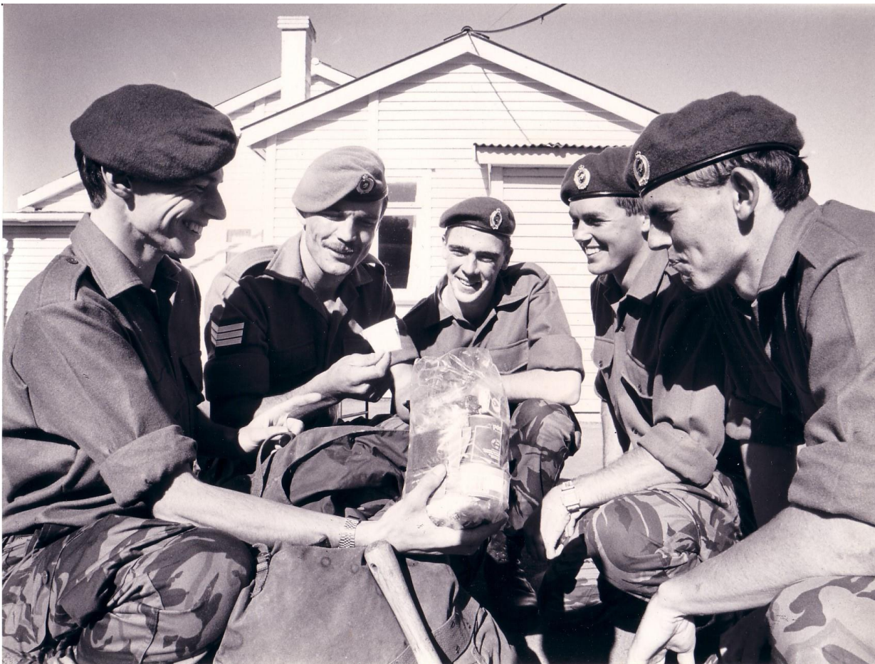
UNI DET – Training at Whangaparoa – May 1989