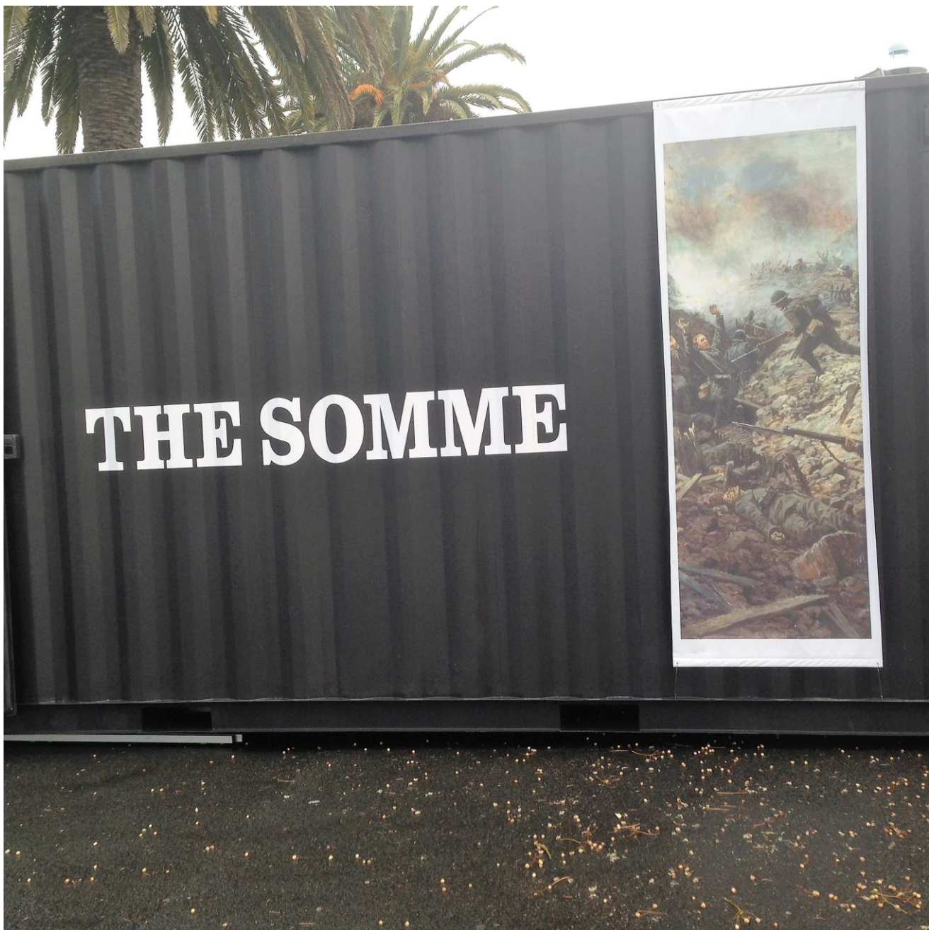
The container at Mount Maunganui