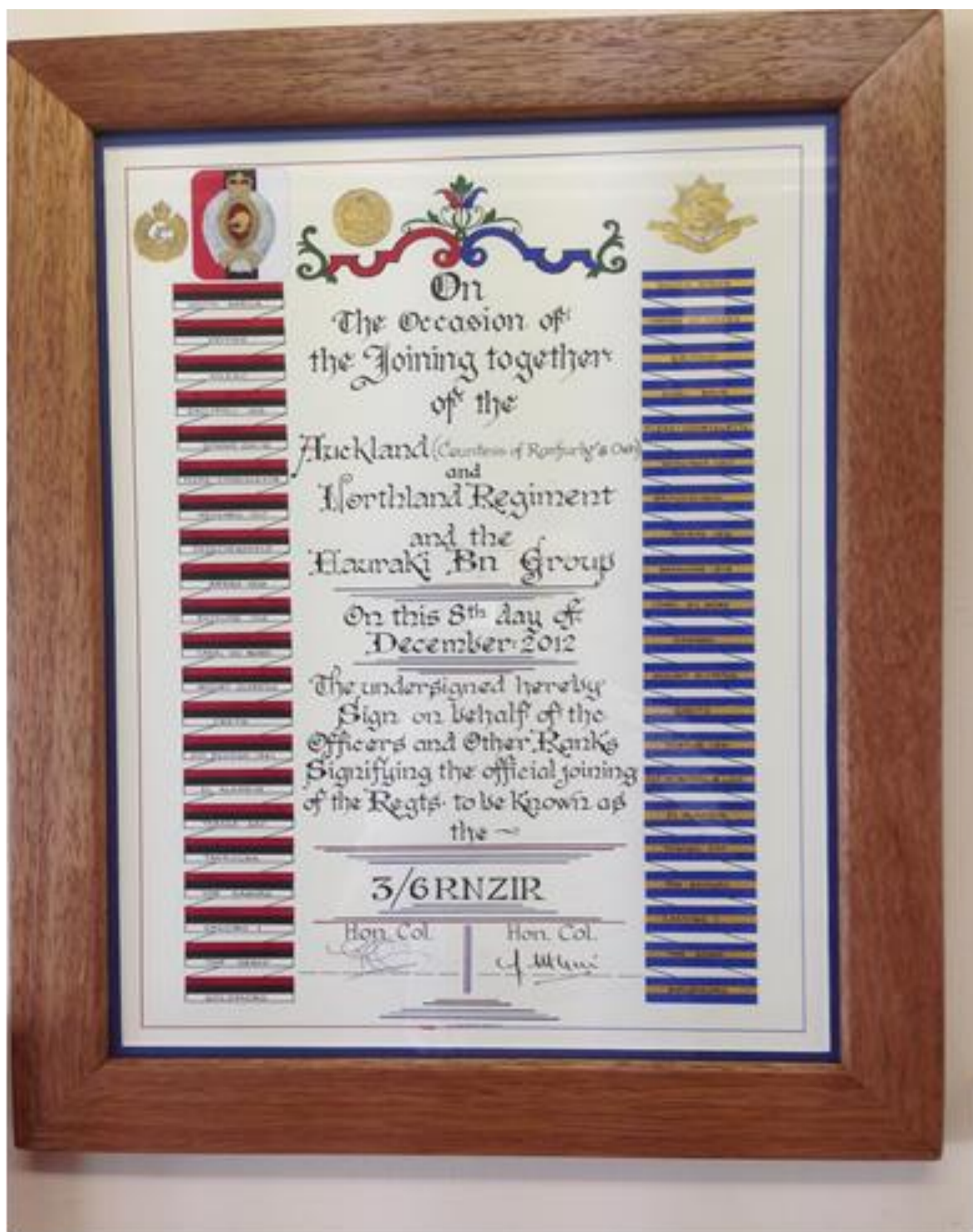
Made by Ray Crafts; on the Occasion of the joining together of the Auckland (Countess of Ranfurly's Own) and Northland Regiment and the Hauraki Bn Group. On the 8 th December 2012. To be known as 3/6 RNZIR.